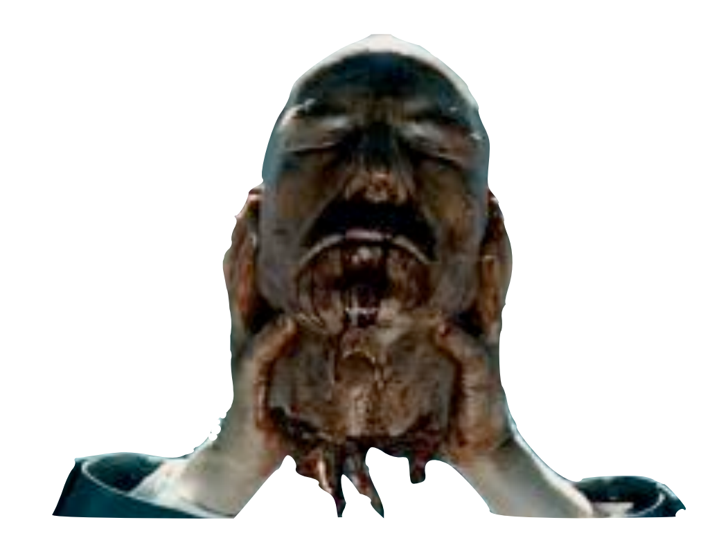
See the full story on the journey to his own demise: Section C, Page 6