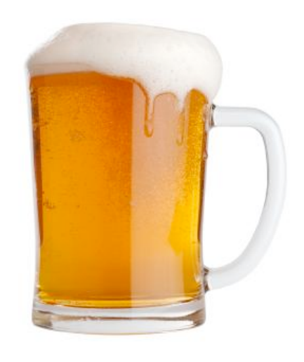
Coincidentally, bar violence has risen by 500%