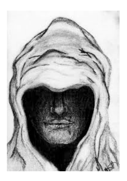
The families of the murderers hired by Macbeth