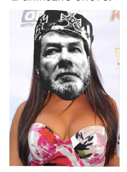
Find out what set Dunki off!