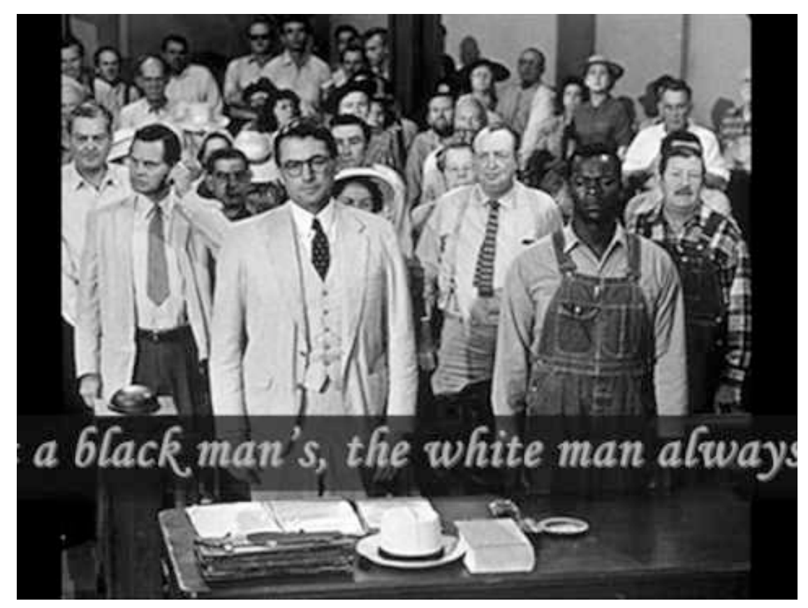
The trial of Tom Robinson