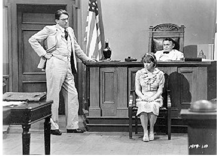
Mayella Ewell on the stand being questioned by Atticus Finch .