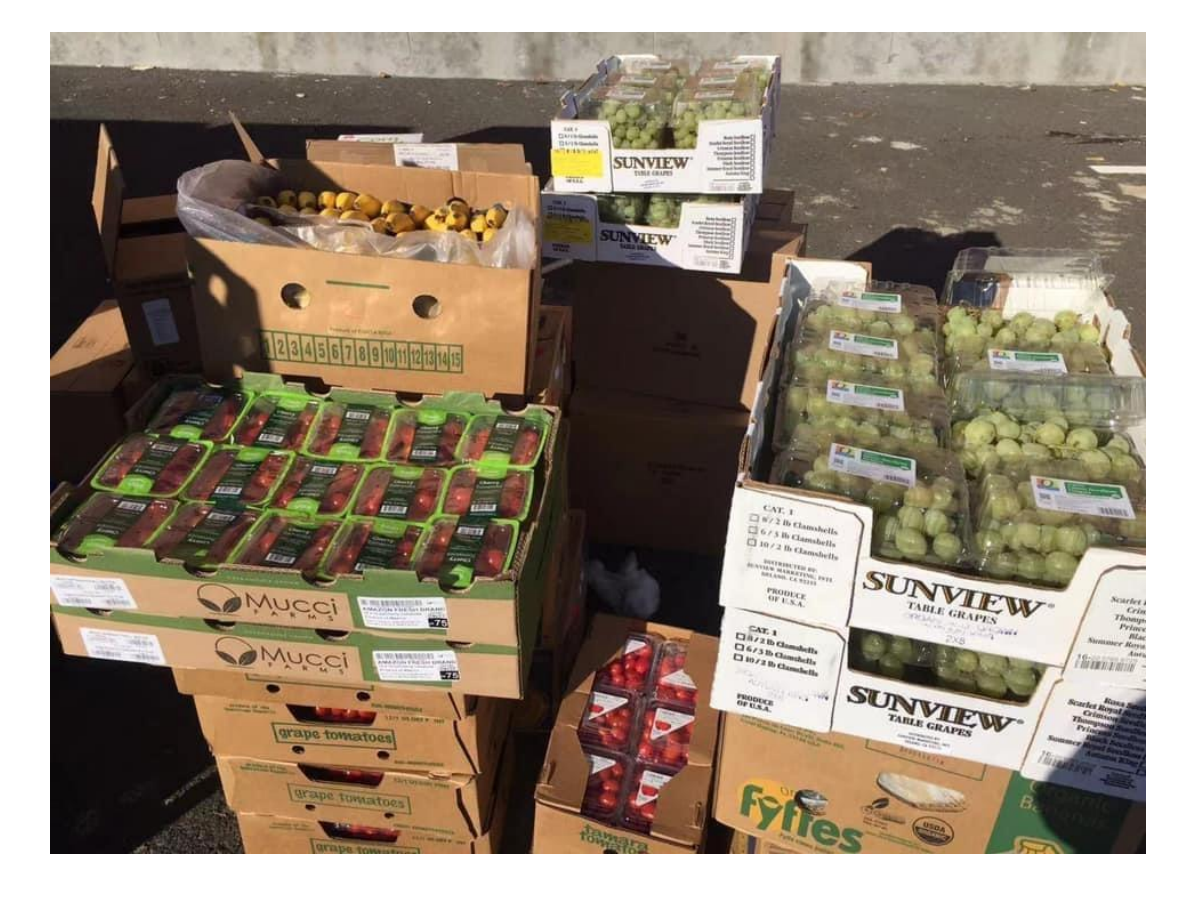
Some weeks we have variety of fruits they could choose from. Example: Grape tomatoes, Bananas, and Muscots