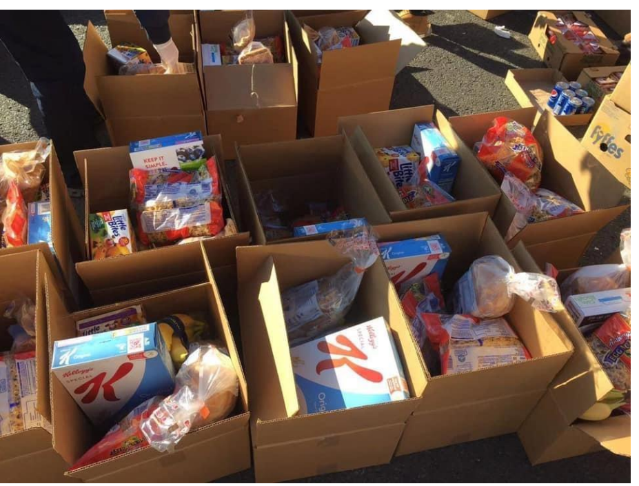
Making sure each box has all 5 categories of food