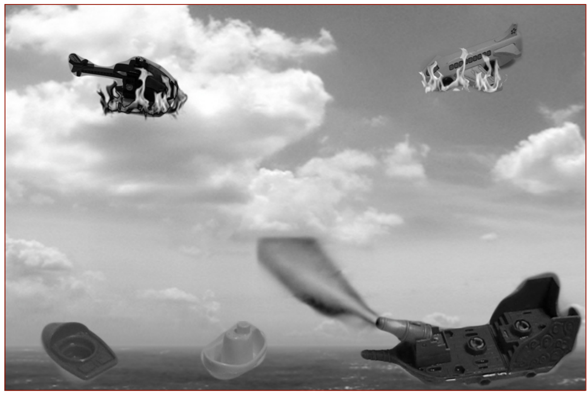
The picture above is of the pearl harbor attack. Two Japanese planes on fire as a US naval ship shoots them down.